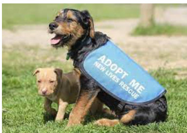
One of the pictures that Faye Carey put on the Facebook page.

In addition , she spent three hours every night organizing people to view the pictures, setting up adoptions and replying to emails. She volunteered on Fridays to post pictures of abandoned animals. As a result , the Facebook page that she put pictures on got 300 likes! Consequently , Faye Carey began putting more pictures of abandoned animals on the Facebook page. Sixteen-year-old Faye Carey displays a teen activist's undeniable creativity. This teen used positive creativity to leave no animal abandoned and un-homed.