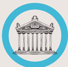
Influence of Ancient Greek-Roman Culture