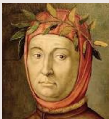
Petrarch-Father of Humanism

Humanism first arose in Italy as a result of the renewed interest in classical culture. Many early humanists such as Petrarch of Italy, who is famous as the Father of Humanism eagerly hunted for ancient Greek and Roman books, coins, and other artifacts that could help them learn about the classical world. Trades with the middle east after Crusades also helped European Scholars to find ancient Greek-Roman Cultures