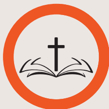
Reformation of Church